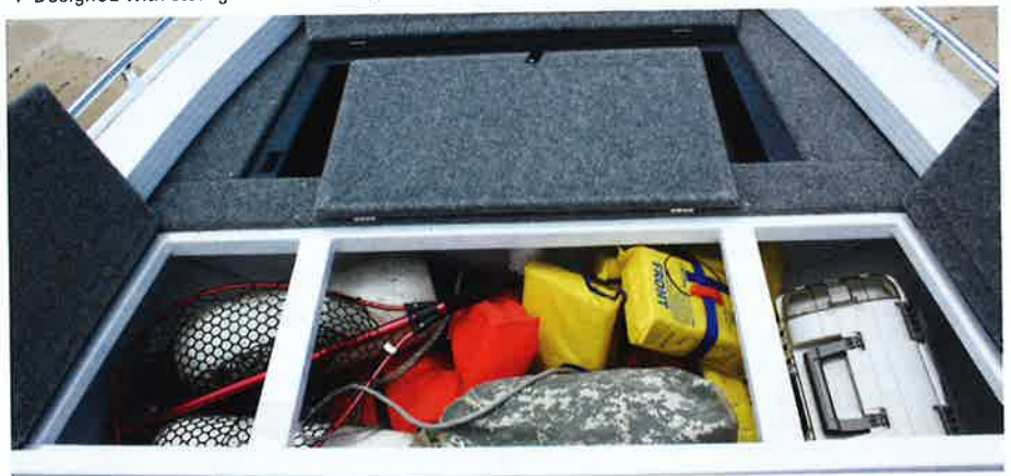
▼ Designed with storage needs in mind.

Nige Webster is northern field editor of Sport Fishing and field editor for Freshwater Fishing magazines. Based at Noosa he fishes the entire east coast in fresh and salt water – offshore – bream – barra – trout.