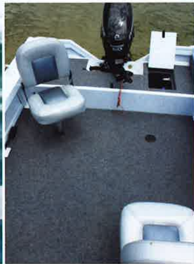
► Space and functionality are key design features for anglers.