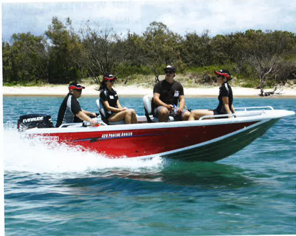
▲ With improved spray deflection throwing water further from the boat, the Proline hull offers an impressively soft ride.

I was quickly impressed with the performance of the Proline hulls: I was able to test a variety of different sized hulls across the wave action of a busy coastal estuary. I was honestly taken by surprise by how easily the hull entered chop. Yes I did get the odd bit of spray but nothing like I was expecting in a cross breeze and easily up there with the driest rides I've had in an aluminium boat of similar dimensions. The hulls resisted