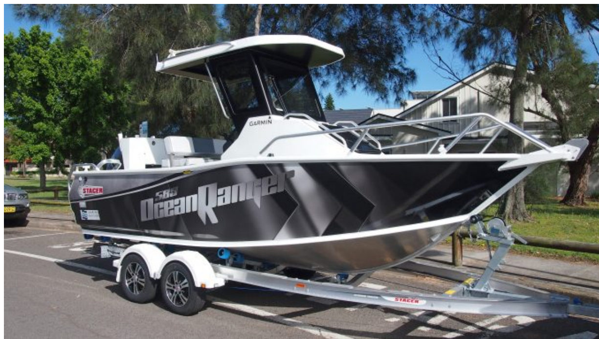
The 589 Ocean Ranger Centre Cab Hardtop is supplied on a Stacer TP alloy Tandem axle trailer with rollers and mechanical brakes. This rig would look great being towed behind any vehicle.

November 29, 2018 Editor Boat Tests, Stacer 0