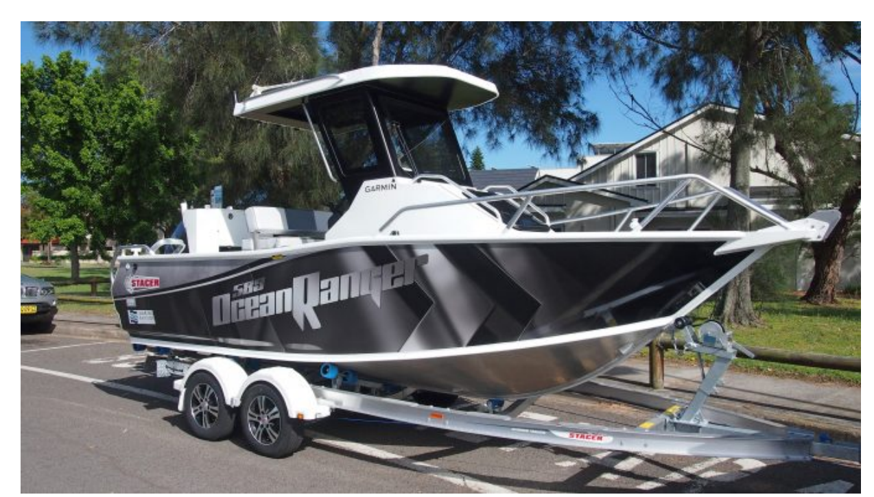
The 589 Ocean Ranger Centre Cab Hardtop is supplied on a Stacer TP alloy Tandem axle trailer with rollers and mechanical brakes. This rig would look great being towed behind any vehicle.