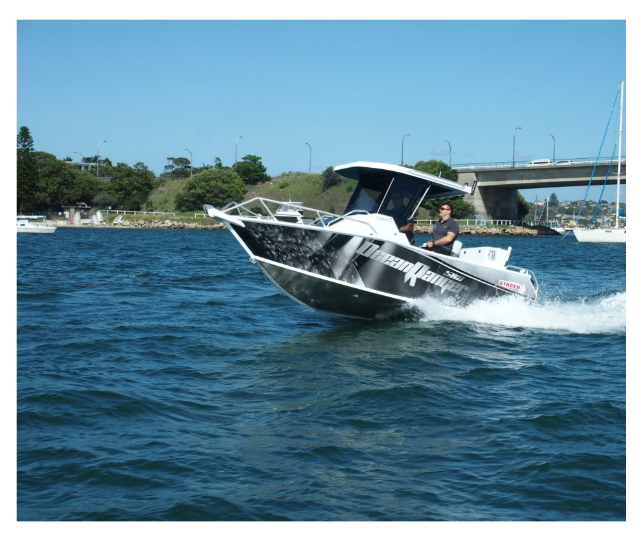
In less than 50m the 115hp 4-stroke Yamaha had the Ocean Ranger up on the plane with ease. Whether you are sitting or standing, you still have clear vision over the console.

The 589 Ocean Ranger Centre Cab Hardtop has a milk crate rib structure of 8 x 6mm vertical stringers, 5mm horizontal ribs, a double wielded solid T chine and keel, a box section floor frame for added strength, super wide gunnels, roto-moulded anchor well for reduced vibration up front, a self-draining checker plate floor (the one tested had a carpeted floor) and a super sump drainage system.