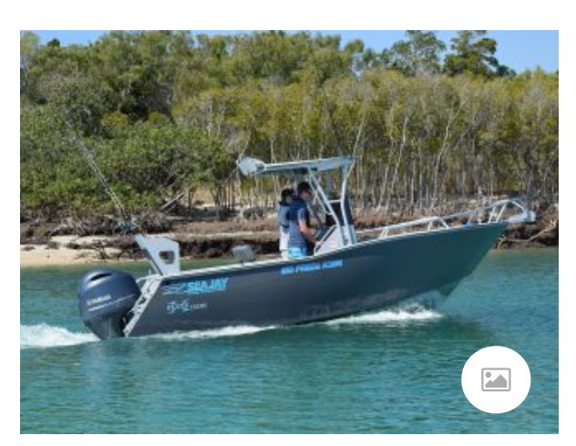
Sea Jay 610 Preda-King with Yamaha F150hp

by Gary Brown • The 589 Stacer Ocean Ranger Centre Cab Hard Top is not only impressive on the trailer or sitting in the water, it's also a weapon when underway. The F115LB 4-stroke Yamaha [...]